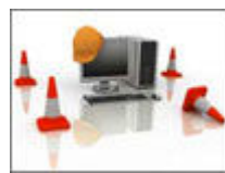
Web Design & Development